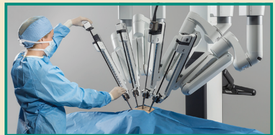
DaVinci Xi minimally invasive robotic system

For more information, call: 850-494-3212 or visit our website: www.westfloridahospital.com