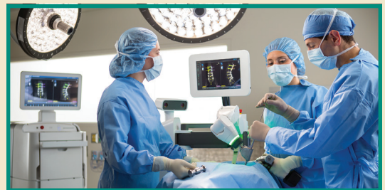
Mazor X minimally invasive system for spine surgery